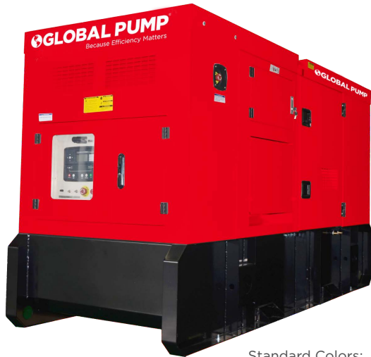
Standard Colors: Red or White

Global Pump generators are specifically designed to provide prime power or temporary power anywhere and anytime utility power is not available.